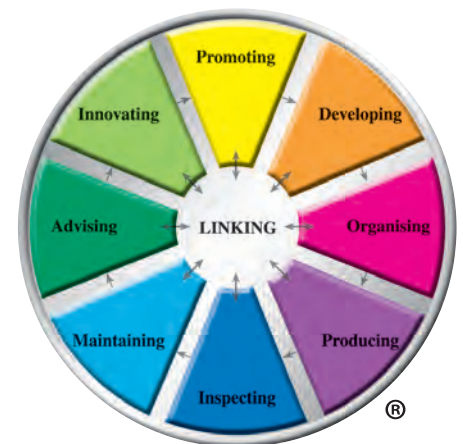
The Types of Work Model